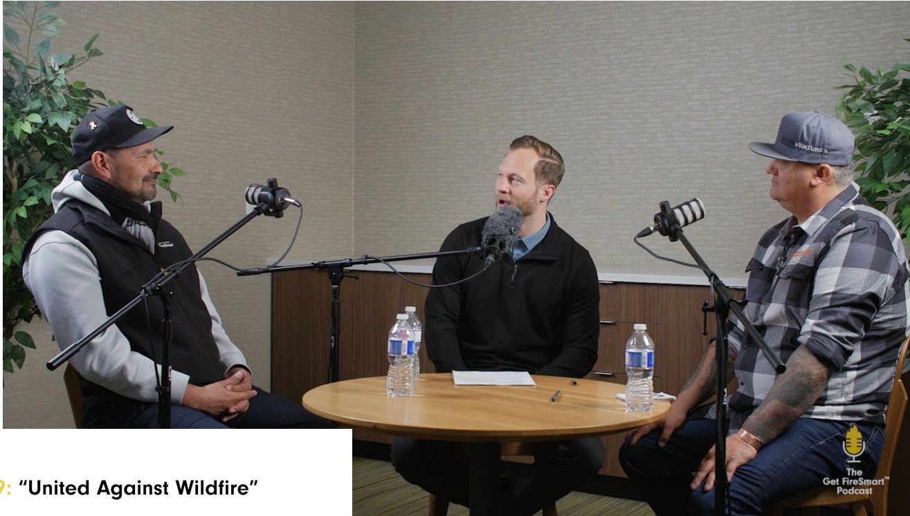
Episode 39: "United Against Wildfire"