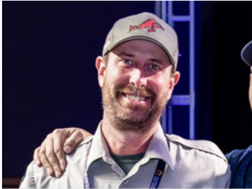
John Salewski Guardian Award