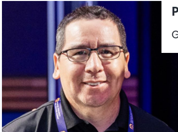
Darryl Adrian Guardian Award