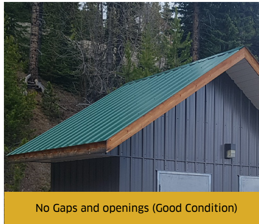
Figure 1. Example of class A rated (metal) roof in poor conditions with gaps and openings that allow ember penetration (left) and good condition (right), with no gaps or openings.

The roof covering should also not have gaps or openings that will allow embers or flames to contact combustible surfaces, accumulate or lodge against the combustible roof sheathing under the roof covering or penetrate the attic space, or interior building space.