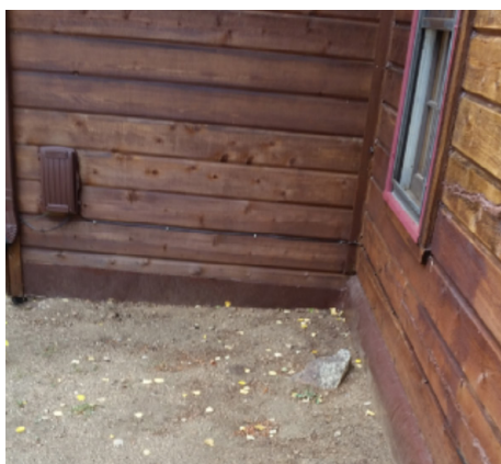
Mitigated Non-Combustible Zone