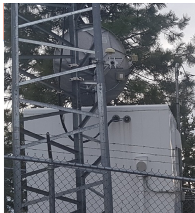
Figure 5. Example of critical infrastructure components that can be damaged by ember accumulation

The area surrounding the critical component should be assessed using the priority zone component of this form