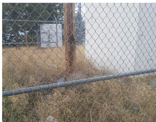
Unmitigated Non-Combustible Zone and Priority Zone 1

Ember, radiant and convective heat susceptibility should be mitigated for all components of critical infrastructure through the assessment process and appropriate combined management of the entire Structure Ignition Zone, which includes the Non-Combustible Zone, Priority Zone 1, and Priority Zone 2. The distances of these zones should be slope-adjusted. The following Structure Ignition Zone graphic provides guidance in the assessment and management of these zones.