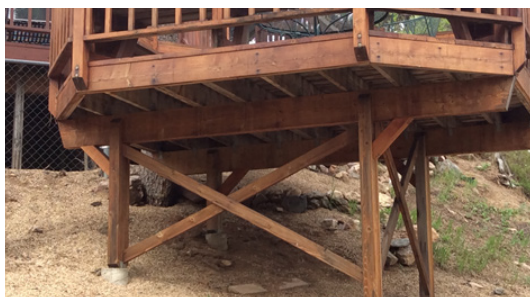
Deck with non-combustible surface and no combustibles stored below