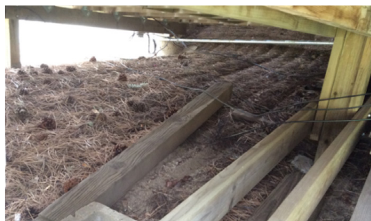
Open foundation with combustible debris

Finally, there should be no combustible debris or material under these features and a non-combustible surface should be maintained under and extending for 1.5 metres beyond the furthest extend of the feature.