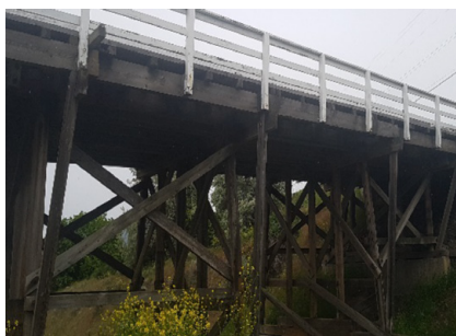
Figure 6. Example of bridge construction gaps and cracks where embers can penetrate and lodge