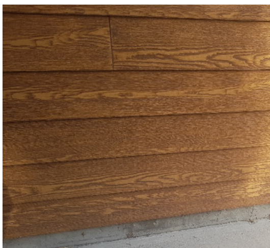
15cm non-combustible clearance