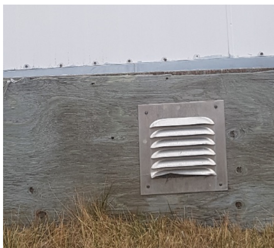
15 cm non-combustible clearing absent

There should be a minimum of 15cm ground-to-siding, non-combustible clearance to prevent siding ignition from ember accumulation along the base of the building